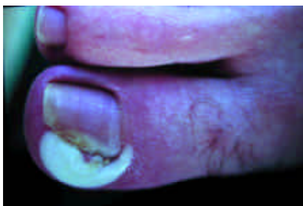
Figure 7b. Immediately after freezing

Povidone-Iodine helps prevent secondary infection. Wounds can be washed and it is important that crust and exudate is removed regularly. Adequate analgesics should be prescribed. Patients should be told to expect some pain, discomfort and swelling initially. Feet will feel sore for several days after treatment of multiple viral warts.