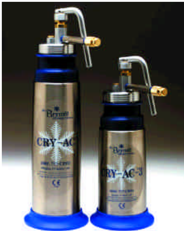
Figure 2. Cryospray base unit with treatment arm and spray nozzle

the skin for treatment. Spray tips bent at right angles can be very helpful to reach certain sites. The nitrogen can be concentrated onto a small area by delivery down neoprene cones or a plastic shield with apertures of different sizes (see Figure 3). It is important to remember that this method increases the destructive power of the treatment and shorter application times will be needed.