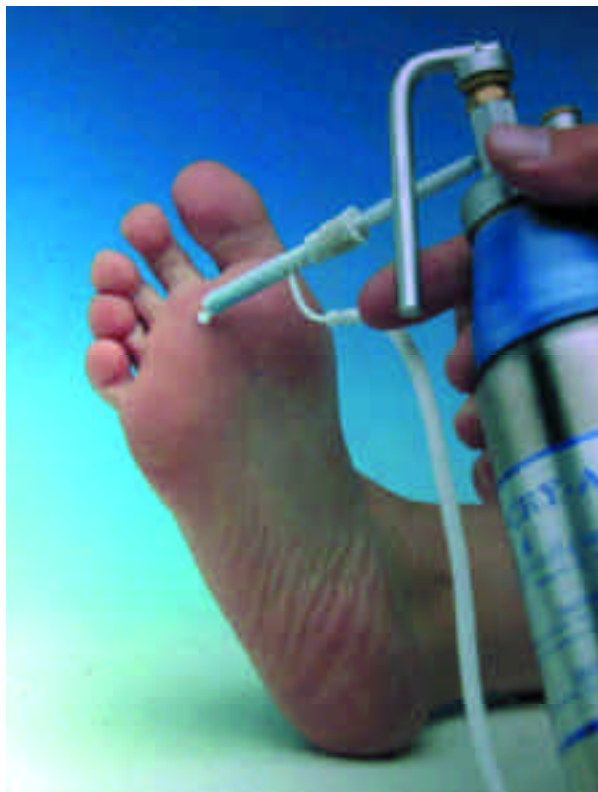
Figure 4. Cryoprobe being used to treat a verruca

For any of the techniques described a second treatment cycle following complete thawing can be used for a greater therapeutic effect. The quantity of interstitial fluid increases following the initial freeze and allows a more rapid iceball formation on subsequent freezing. Double freezes are more useful for malignant disease but some specialists find them helpful for benign lesions. It is absolutely vital to gain experience using more conservative treatment schedules before progressing to more aggressive ones. Each piece of equipment, nozzle size, air temperature, etc, has an impact on the clinical effect and the goal should be to provide a predictable response.