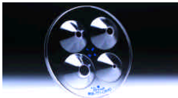
Figure 3. Plastic shield with holes of varying diameter

Cryoprobes (see Figure 4) allow the nitrogen to circulate around the treatment tip but it is then vented through a plastic tube and it is only the metal tip that contacts the skin. Probes have their advocates and they allow the operator to apply pressure during the procedure. This gives a deeper freeze and some authors feel this is the treatment of choice for verrucae. When used in this way it is common to apply lubricant jelly first to obtain good contact. Not only does this ensure even freezing of the tissues but allows the frozen skin to be lifted off deeper structures by elevating the probe once ice has formed. This is not necessary on the plantar surface but is helpful on the dorsal surface to avoid cold injury to tendons, nerves and blood vessels.