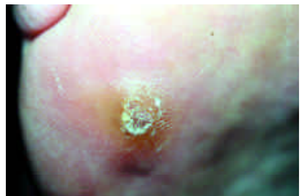
Figure 6. Verruca

These are synonymous and are lesions produced by infection with human papilloma virus (HPV). Verruca often refers to lesions on the sole of the foot or plantar warts (see Figure 6). There are more than 50 subtypes of HPV and the subtype usually determines the anatomical distribution and morphology of the lesion. In other words it would be unlikely that the same subtype would produce both a filiform wart and a mosaic verruca. There are varying host responses that